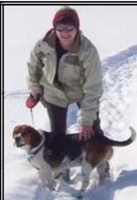
Buddy learns about New England winters

Murphy's doing just great. He's getting more self assured every day and, even shows interest in strangers who we meet when walking. At home, he has the run of the house and is quite the 'velcro' beagle! He's sweet and very well behaved.