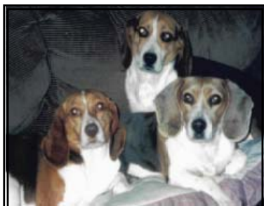
Teddy (middle) with his beagle pals Pebbles (l) & Brandy (r)

During the Christmas season of 1998, I noticed Teddy was quiet, reluctant to jump on the sofa or play with the other dogs. He was also uncomfortable when picked up. This got worse and I noticed he was limping and didn't wag his tail so I took him to the vet. They tried some prednisone at first, thinking he pulled something playing.