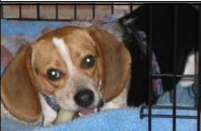
Murphy relaxes in his bed

Rufus had quite the fan club on the website as I posted many pictures of the progress he was making. I got so many emails when he was sick and he was taken off the website for awhile. Before long he was back by popular demand! Thanks to all who sponsored Rufus and sent well wishes during the last year. He really appreciates it!