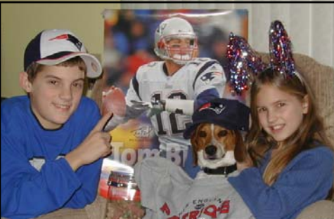
Rusty gets into the Patriots spirit with his new fans

Riley is doing awesome. He was a perfect addition to our family. We couldn't have asked for a better dog. He is a great combination of a crazy energetic puppy and a calm, cuddling companion. We take him everywhere we go - he loves to go to Petco and smell and lick everything. I am so glad that I found BONES and found Riley. This organization does amazing things - it makes so many people happy and giving these dogs a second chance at a good life is just a beautiful thing.