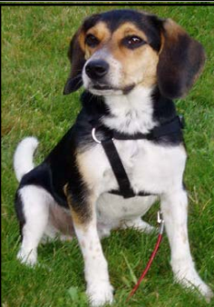
Riley strikes a pose

I thought it important for me to let you and everyone else at BONES know how much having Buddy has meant to us. He is and always will be a part of our family. He is a very funny dog, but smart - very smart. He picked up the rhythm of our household in a matter of days. He knows Monday morning and doesn't like it, since we have to leave him. He knows Friday when I have the day off . When he upset, he goes to his basket of toys picks out something and keeps squeaking it until he feels better. My husband will say "give me five!" and Buddy slaps his paw on my husband's hand. He has toys, a blanket, pillow, water bottle, 2 dog beds. But that isn't what makes him happy. Being part of our family is what makes Buddy happy. And having this sweet dog has brought us such joy.