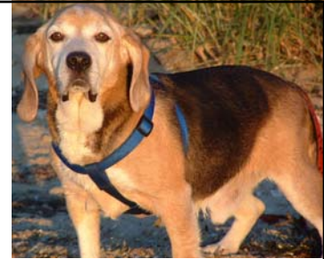
Rufus gets some sun

Poor Rufus had a variety of ailments – a cancerous growth removed from his chin , Lyme Disease, a severe hernia and a heart murmur that was just about as bad as it gets. However, with the right medication and lots of TLC from me and my hounds, he started to feel better and become more youthful. He started playing like a puppy again. Needless to say on 10/31/04, I officially adopted Rufus. I wondered why no one was surprised when I told them the news.